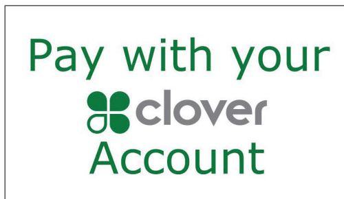
That's it, there isn't even a step three! We will bill your Clover account for the price of the paper