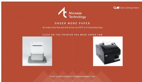
Step 1- Select the Clover device for which you would like to order paper

Order More Paper takes all of the pain points out of ordering paper for your POS and makes it a simple 2-step process. All orders are shipped from our centrally-located warehouse and arrive in 3-5 business days via USPS.