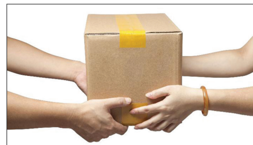
We even instantly issue a tracking number so you can track the USPS package right away